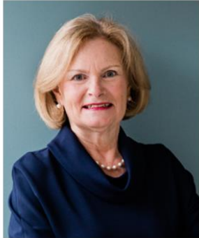
Anne L. Coghlan Scholarship

Filter awards by: All | Undergrad Level | Any Level | Available to RNs or RPNs | Graduate Level | Research Awards | Show historical awards